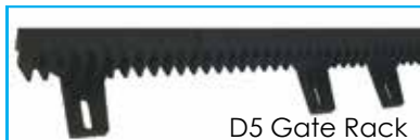
D5 Gate Rack

The opening and closing speeds as well as the ramp up/ramp down are independently adjustable. This means that you can have your gate opening at full speed and closing at a slower rate, this will help reduce accidents and damage to the gate.