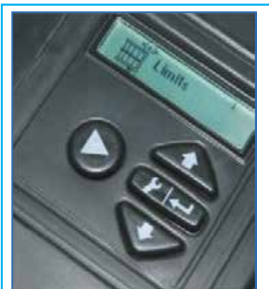
D5 Control Panel

The HD heavy duty steel reinforced rack is supplied in 1m lengths 6 point fixing (legs down) and is suitable for gates weighing up to 1000Kgs.