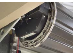
Weather Resistant Opener