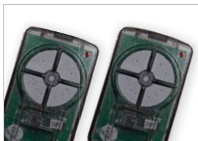
Two TrioCode™128 transmitters